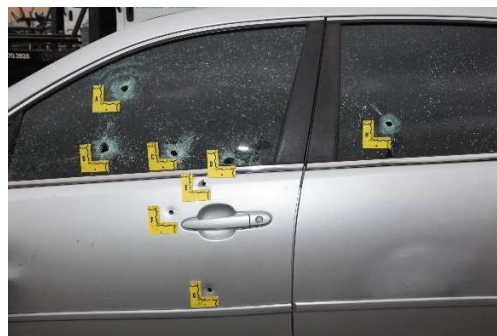
Bullet Holes on the Driver's Side of Gallegos' Vehicle

Eight gunshot holes were on the driver's side of the vehicle; four in the driver's window, three on the driver's door, and one in the driver's side passenger window. The vehicle was still in drive, and the key was in the ignition, but the engine was not running.