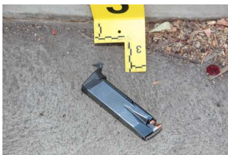
Close-up View of Loaded Handgun Magazine

An expended bullet was located just south of the magazine, and three expended bullets were subsequently recovered from Gallegos' vehicle. Criminalist Alexandra LaMay conducted an examination of the expended bullets, and determined that three of the bullets originated from Decarvalho's service weapon, and one bullet originated from Valenzuela's service weapon.