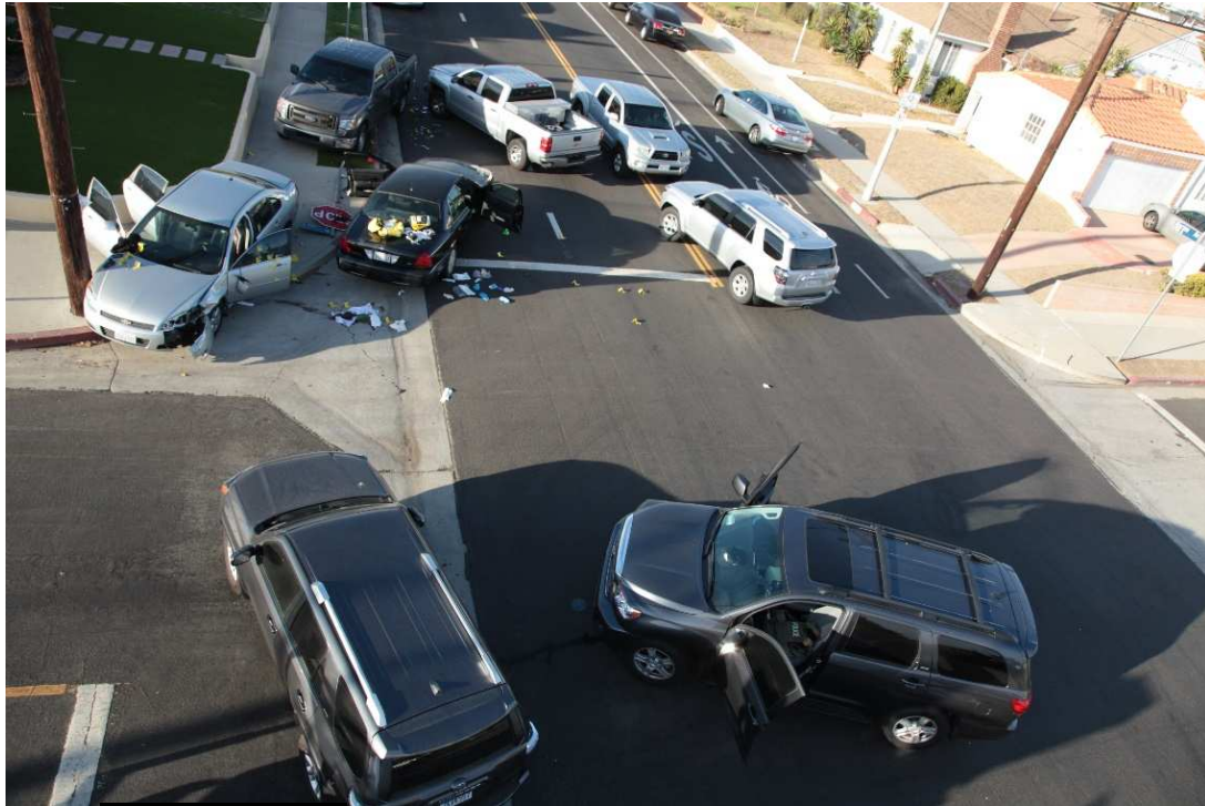
Vehicles Surrounding Gallegos' Vehicle Post-Shooting

Morales' vehicle, a [REDACTED] truck, was parked northeast of Gallegos' vehicle and facing northwest in the southbound lane of Marine Avenue. Morales' truck had moderate front driver's side damage. Lastly, a [REDACTED] truck, with minor front-end damage, was parked facing south, behind Gallegos' vehicle. The front passenger tire, front driver's side tire, and rear passenger tire of the vehicle were all on the sidewalk of Marine Avenue.