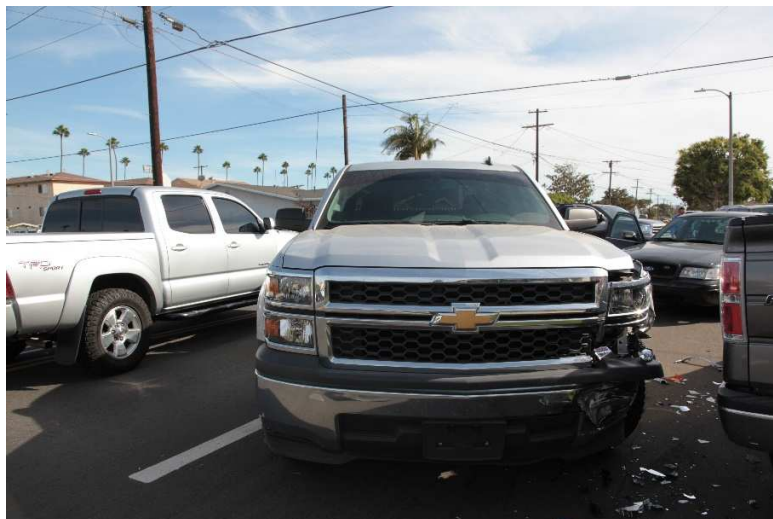
Morales' Vehicle [REDACTED] with Front Bumper Collision Damage

A loaded Sig Sauer Sig Pro handgun magazine was located on the sidewalk, on the driver's side of Gallegos' vehicle. A subsequent examination of the magazine revealed it was loaded with ten .40 caliber cartridges.