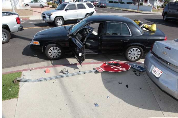
Stop Sign - Knocked Over on Ground

flat. The front doors and rear passenger side door of the vehicle were open. The front passenger side of the vehicle was partially against the power pole, and there was moderate damage on the front driver's side of the vehicle, as well as some collision damage to the rear bumper area of the vehicle.