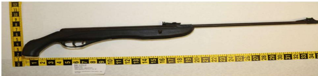
Figure # 2 - Photograph of Mitchell's altered Crosman Air Rifle

Cuny, Williams, and Satterfield approached the Honda under cover of a ballistic shield on the driver's side. Mitchell remained unresponsive in the driver's seat of the car with the weapon still on his lap. Cuny removed the weapon from Mitchell's lap and passed it to Satterfield. The weapon was a black .177 caliber Crosman Phantom Break Barrel Air Rifle from which the buttstock had been removed but with the grip left in place. See Figure 2 below.