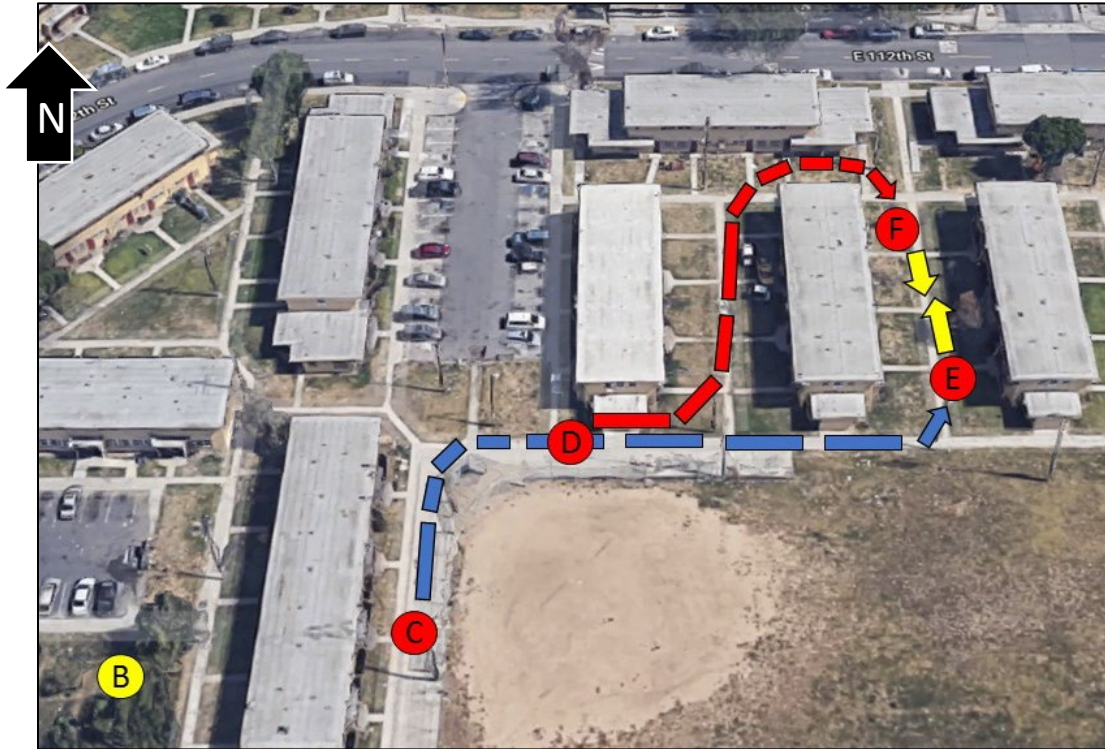
Figure 4: Risher (F) fired at Zaragoza (E) at least two times, striking Zaragoza in the left arm. Zaragoza fired approximately seven shots from his position.

When Risher saw Zaragoza, he shot at him a second time, striking Zaragoza in the left arm. Zaragoza returned fire, shooting approximately seven times at Risher. Two cartridge casings located in this area matched Risher's handgun.