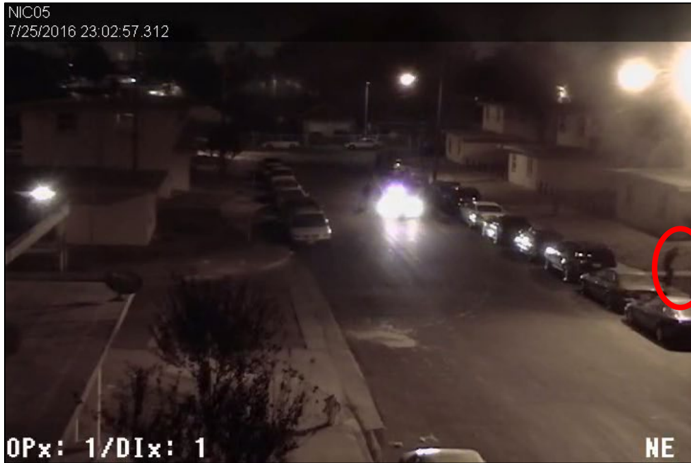
Figure 8: Zaragoza (circled in red) fired five rounds in an eastward direction as Risher ran north. Chavez was exiting his patrol vehicle as Zaragoza was shooting.

investigators they watched as people from the neighborhood apparently collected and removed evidence.