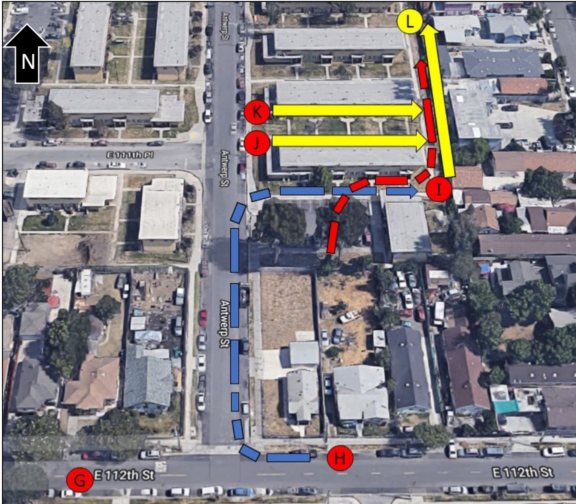
Figure 7: Fernandez ran west on 112th Street, north on Antwerp Street, and east through a parking lot before shooting at Risher from the southeast corner of an apartment building (I). Zaragoza shot at Risher from the northeast corner of that same building (J). Chavez shot at Risher from a position just north of Zaragoza (K). Risher fell on the sidewalk east of the apartment buildings (L).

Risher continued running north as the officers fired their weapons. He dropped a 9mm, semiautomatic handgun and fell approximately 30 feet north of the handgun.