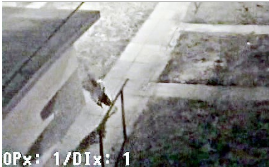
Figure 3: A surveillance camera captured Risher running from Zaragoza while holding a handgun, just prior to shooting Zaragoza in the arm. The contrast of the image has been altered to enhance the image.

After the exchange of gunshots, both Risher and Zaragoza ran north and east. As Risher ran north and turned east at the corner of one of the buildings, he was captured on surveillance video. That video showed him carrying a handgun in his right hand as he turned the corner.