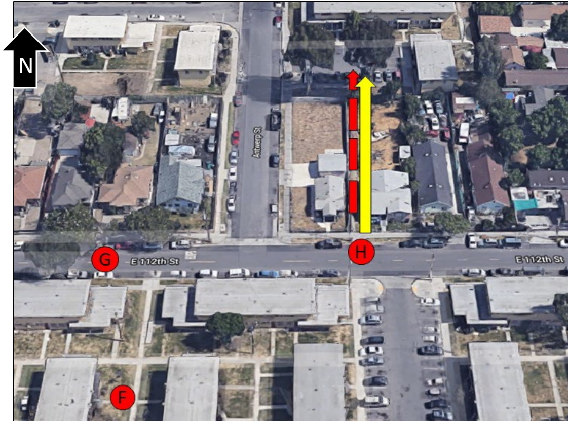
Figure 6: Risher ran north through the property of [REDACTED] 112th Street. Fernandez shot at Risher from the mouth of the driveway of that property (H).

After firing at Risher from the mouth of the driveway, Fernandez ran north on Antwerp Street and east into the parking lot that bounds [REDACTED] 112 th Street to the north.