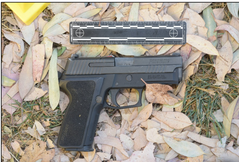
Figure 10: Risher's handgun was located thirty feet from where he fell.

Four shell casings collected at the crime scene were matched to Risher's weapon.