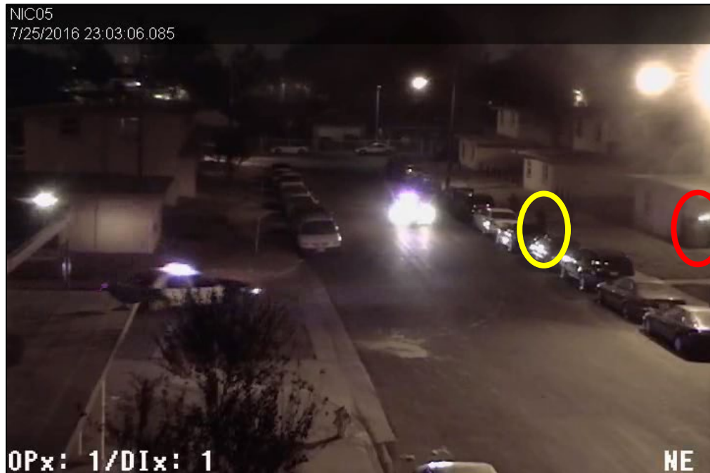
Figure 9: Chavez (circled in red) fired five rounds in an eastward direction after Zaragoza stopped shooting. After firing this volley of shots, Zaragoza (circled in yellow) ran north on the sidewalk adjacent to Antwerp Street, parallel to Risher.

The handgun dropped by Risher was examined and found to be operable and loaded with one cartridge in the chamber and two cartridges in the magazine. The handgun was swabbed for