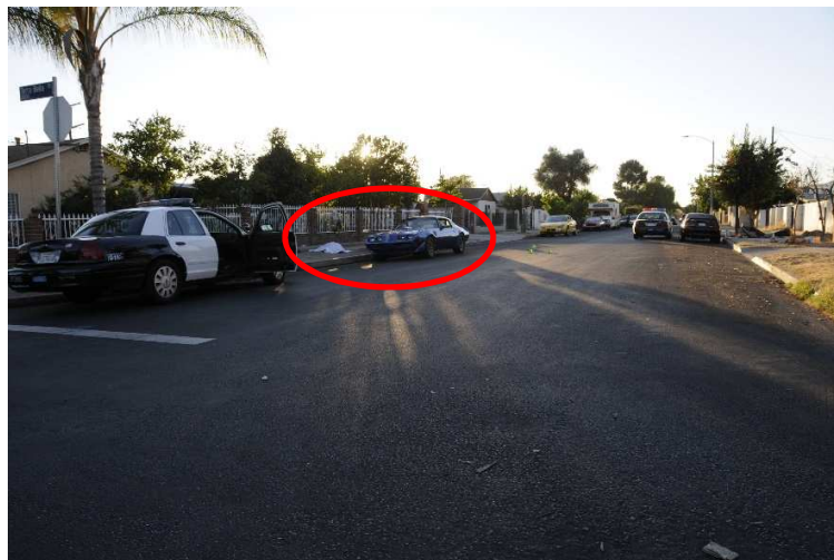
Intersection of Terra Bella Street and Ilex Avenue with Unoccupied Blue Pontiac

While looking for the address given in the update, Bennet and Schiappapietra passed an unoccupied blue Pontiac Firebird, parked facing south along the west curb of Ilex Avenue. The parked Pontiac was directly in front of where Torres and Sonia T. were seated on the cement/wall footing.