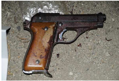
Close-up Photo of Gun Recovered from the Scene