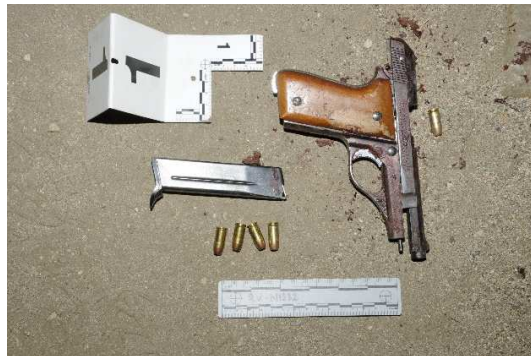
The Five Live Cartridges Recovered from the Gun

The handgun was subsequently examined for latent prints and DNA evidence. The latent print results were inconclusive, but Torres' DNA was found to be on the handgun. 18