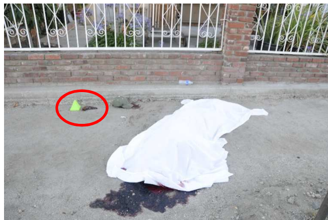
Gun with Evidence Tag in Close Proximity to Torres' Body

A .380 caliber, blue steel semiautomatic handgun with wood grips was recovered from the dirt sidewalk in close proximity to Torres' body.