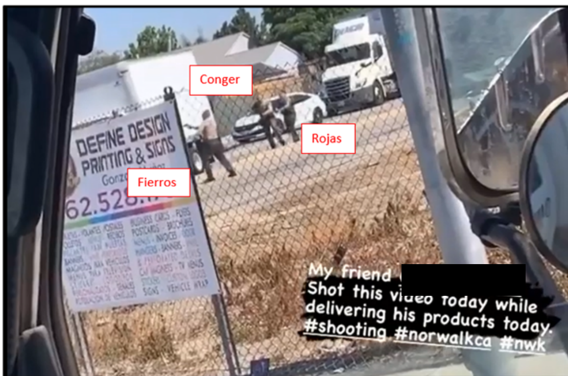
Figure 6: Cell video still showing Fierros fire his weapon.

Investigators recovered video footage of the incident apparently captured by someone driving by and uploaded onto the internet. The footage begins after the box truck was rolling forward. Fierros and Rojas are seen jogging after the truck as it rolls. Fierros fires one shot into the driver side of the cabin. The truck's front driver side wheel jumps a raised concrete center median and slowly crashes into a traffic pole. Fierros jogs up to the rolling truck and opens the driver door. He points his pistol into the driver side of the cabin, holding the door open and walking along with the truck until it crashes to a stop and the video ends. The sound of Fierros' gunshot can be heard in the video. The deputies' commands, or communication from Holder, if any, cannot be heard.