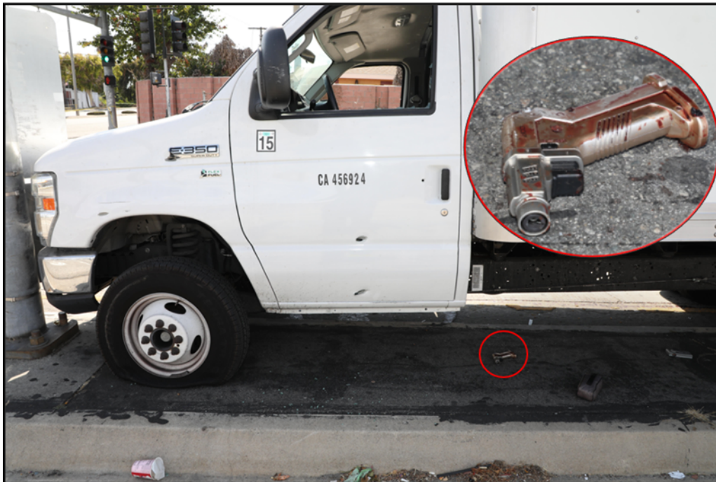
Figure 1: Photo of pistol-shaped lighter that Pimentel removed from the truck cabin.

Deputy Jose Pimentel arrived moments after the incident. He stated to investigators that he observed Holder unconscious inside the truck, slumped across the driver and passenger seats. Pimentel saw what he perceived to be a pistol lying next to Holder's right arm, in the space between the seats. Pimentel removed the item—a metallic pistol-shaped torch lighter with apparent blood on it—and placed it on the ground underneath the truck.