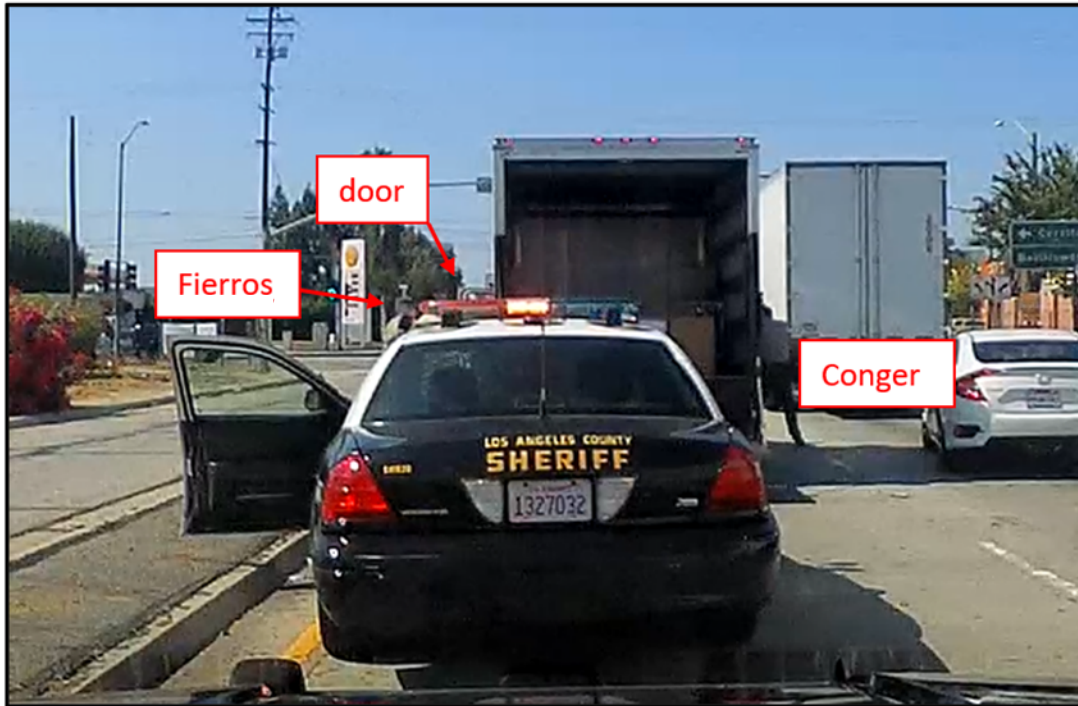
Figure 4: Dashcam still showing Fierros open the truck door. (Rojas is out of view, to Fierros' right.)