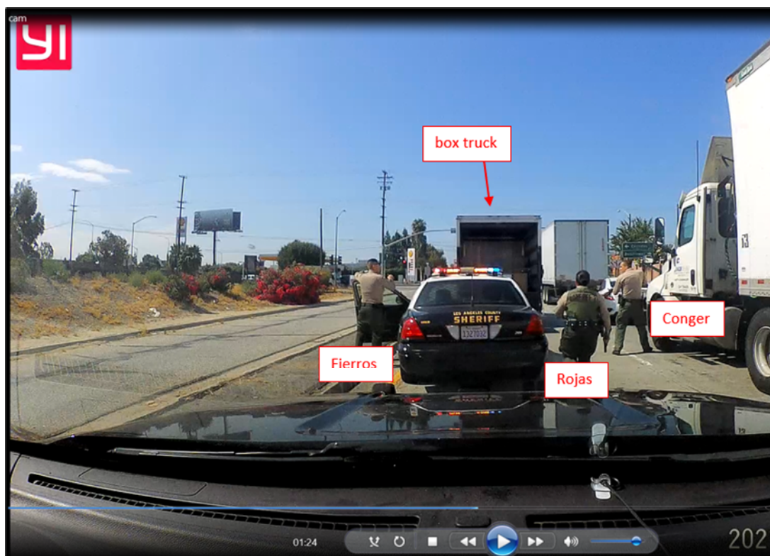
Figure 2: Dashcam still showing the three involved deputies moments after the box truck stops at the red light.

Fierros' patrol car is first in line behind the now-idle truck, followed by Conger's. Fierros exits his car pointing his service pistol at the truck as Conger exits his car and walks into view armed with a rifle. Rojas appears shortly after with her service pistol drawn. Fierros and Rojas approach the driver side of the truck as Conger approaches the passenger side.