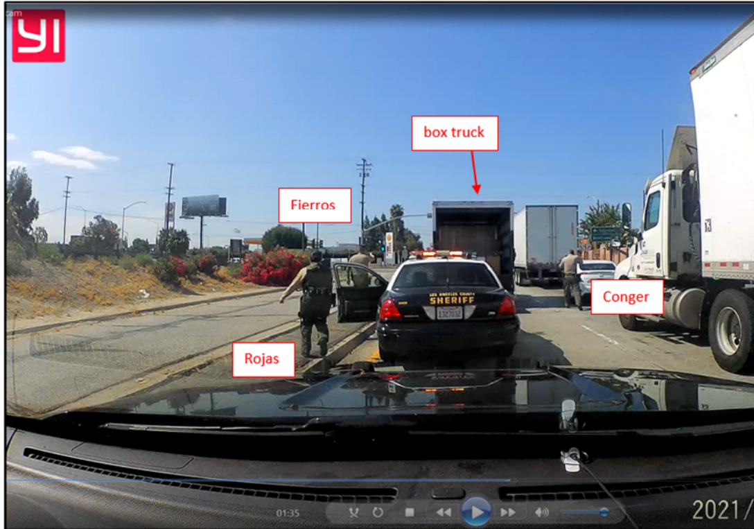
Figure 3: Dashcam still showing deputies approach the truck.

Fierros reaches the driver door, opens it, and jumps back as if startled and appears to open fire immediately, as do Rojas and Conger. The three deputies fire their weapons and back pedal away from the truck. It is not clear from the footage whether Fierros or Conger is the first to fire. Meanwhile, the traffic light at Alondra Boulevard turns green and surrounding traffic proceeds forward. A few moments later, the truck slowly rolls forward with the deputies jogging alongside it, until the truck appears to collide into something and comes to a stop several car lengths closer to Alondra Boulevard. The deputies approach the driver and passenger sides of the truck again but are now largely out of view of the camera, which is blocked by Fierros' patrol car in the foreground.