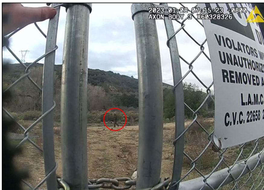
Figure 1: Still frame from McDonald's BWV showing Foster walking eastbound on dirt road before deputies gained access over and through the chain link gate separating Spunky Canyon Road from the dirt road.

barbed wire, that provided access through the fence. Bolt cutters were used to cut through the barbed wire. Corrales was the first deputy to climb over, and McDonald followed. Other deputies were able to cut a hole in the gate and climb through.