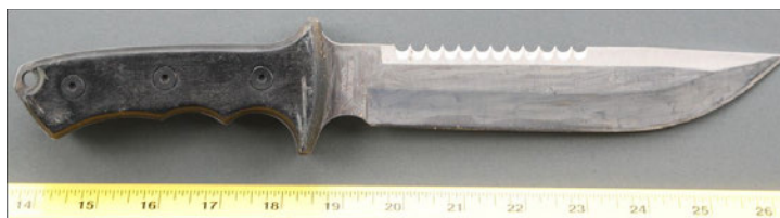
Figure 2: Knife held by Foster during deputy-involved shooting. The blade measures approximately eight inches in length.

Once more deputies were on the same side of the fence as Foster, they began giving commands to Foster. It became apparent that Foster did in fact have blood on him. Foster continued walking east, 50 to 70 yards away from the deputies, until he reached a dead end in the dirt road. The fence blocked Foster from continuing to walk away from the deputies. At about this time, Corrales remarked to the other deputies, "He has a knife in his hand." Foster remained about 50 to 70 yards away from the deputies as the deputies started trying to communicate with him.