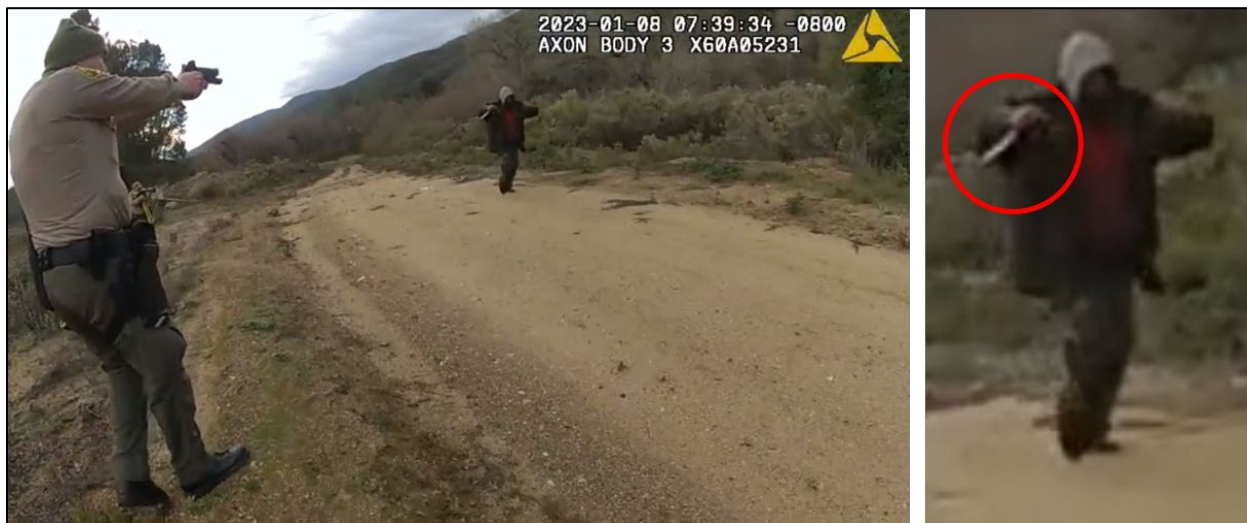
Figure 5: Still frame from Soria's BWV depicting Foster as he starts running toward deputies. Inset shows close-up of knife in Foster's right hand. McDonald is in the left portion of the frame.

The deputies formed an arrest team and approached Foster approximately two-and-a-half minutes later. They handcuffed him and started rendering medical aid. Emergency personnel arrived 24 minutes later. Foster was pronounced dead at the scene.