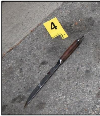
Photo of the knife located in the street next to Nguyen's left foot.

After this incident, Calatayud's duty weapon was examined and found to contain sixteen rounds. Two expended 9mm casings were recovered from under the back of a pickup truck parked at the south curb of Cortada Street adjacent to Calatayud's vehicle. One expended 9mm casing was recovered from the street approximately three feet south of the front passenger door of Calatayud's vehicle. The positioning of the expended casings is consistent with Calatayud's position behind his vehicle's driver door. A narrow sharp-bladed 14-inch-long kitchen knife with an approximate seven-inch metal blade was located on the street a few inches west of Nguyen's left foot.