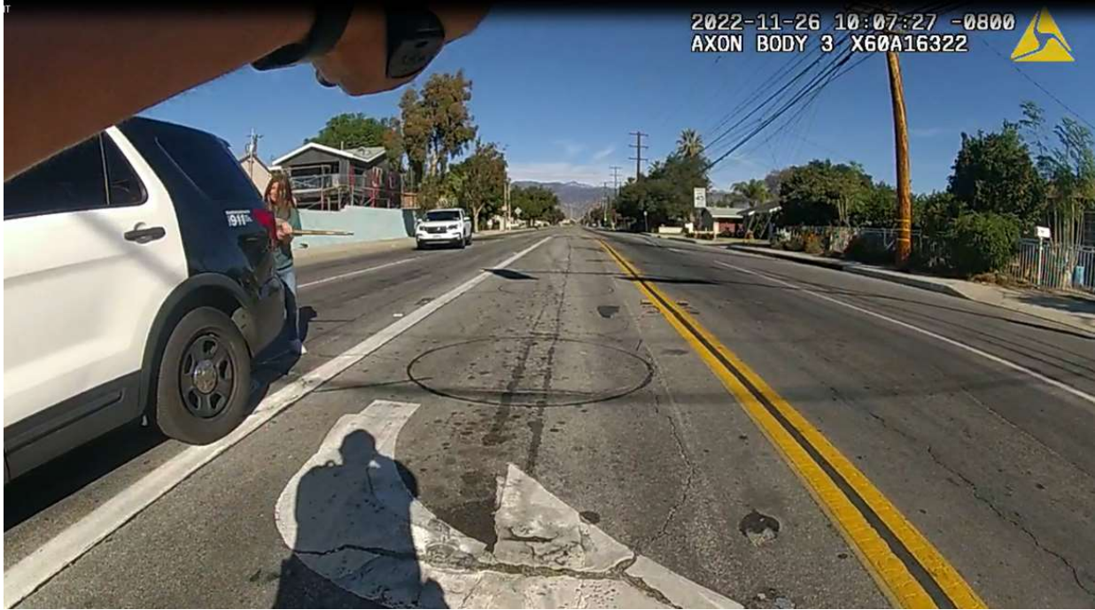
Figure 3: Blaney emerging from behind the patrol vehicle.