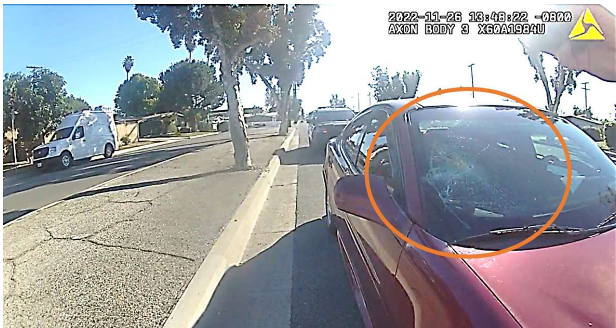
Figure 1: [REDACTED]'s broken front windshield.