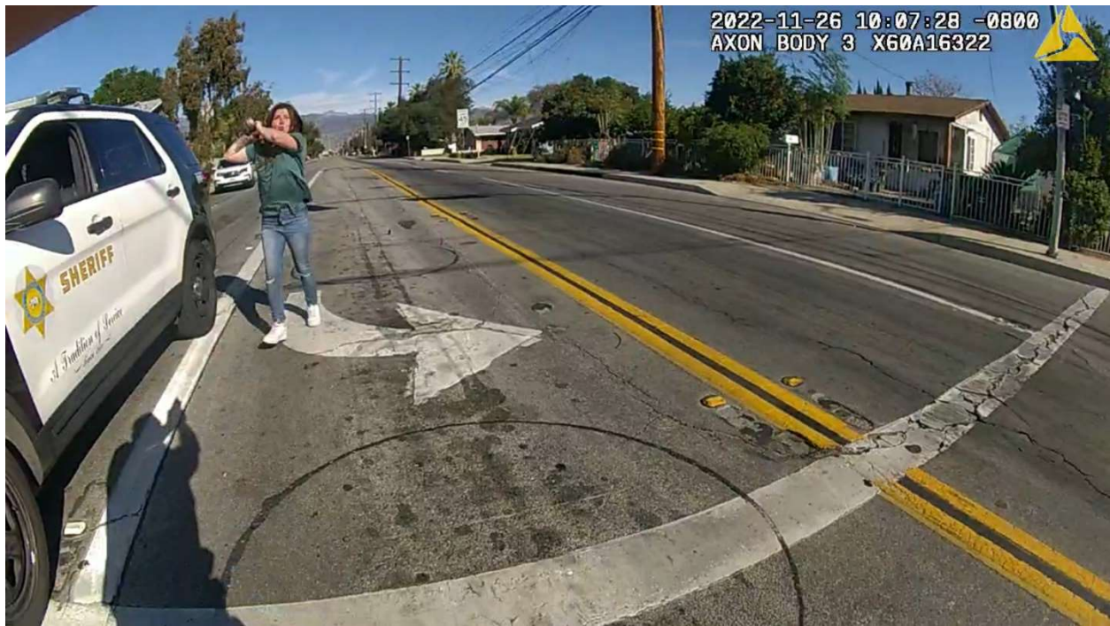
Figure 4: Blaney advancing toward Valencia.