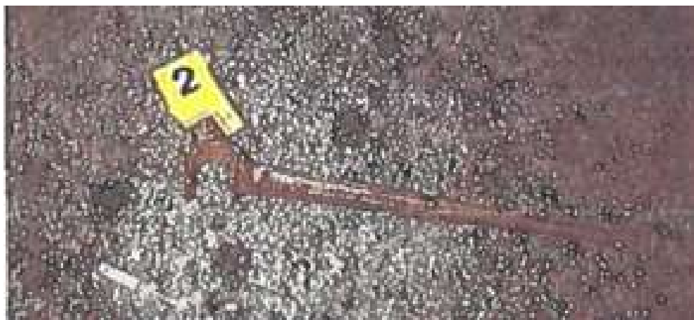
Figure 7: The wrench.

Deputies recovered a metal, valve wheel wrench from the scene. It weighed approximately 10 pounds and was approximately 2 feet long.