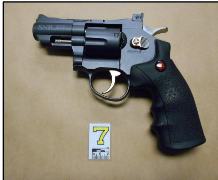
Figure 3: Pellet gun recovered from Infiniti.