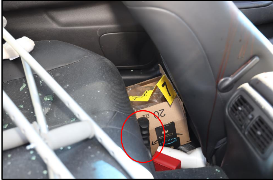
Figure 2: Butt of pellet gun is visible behind driver seat of Infiniti.