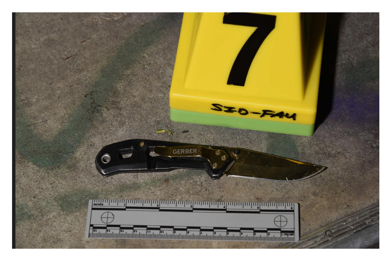
Still photo of Olivio's knife recovered from the apartment complex courtyard.

Investigators recovered Olivio's knife from the bottom step of the apartment complex courtyard.