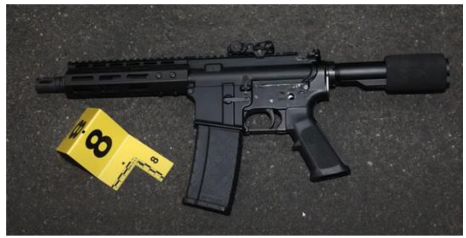
Figure 4: King's rifle.

Detectives asked King where he obtained the rifle and King said that he made it himself. King said that he had test fired it at a shooting range earlier that night to make sure it worked. King explained that the rifle was a single-fire capacity without a safety because he, "Does not have time to be safe." When asked if he wanted to die, King said that he did not but, "It's gonna go how it's gonna go."