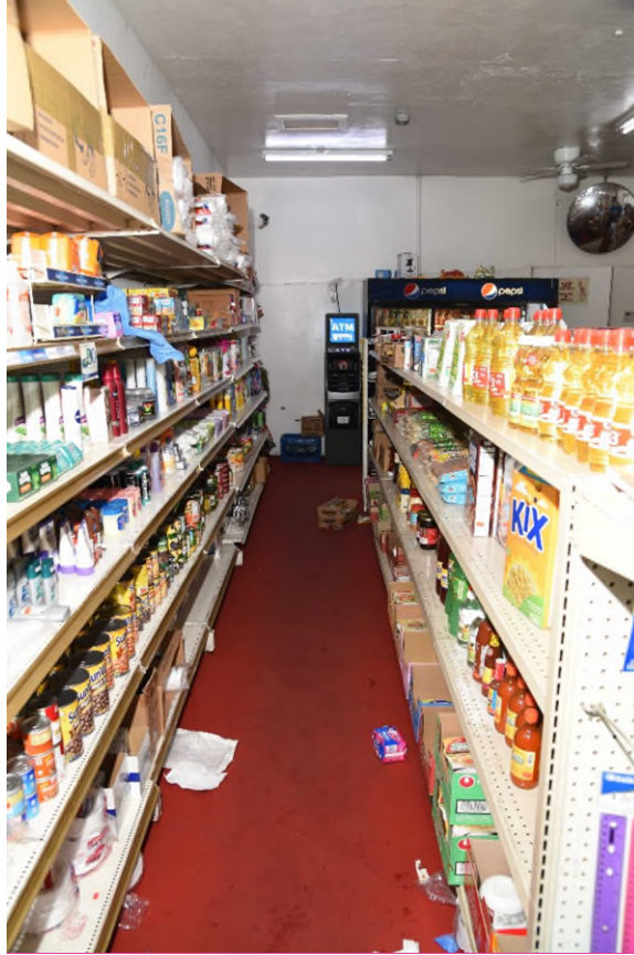
Photograph of the aisle in Junior Mini-Market where the shooting took place.