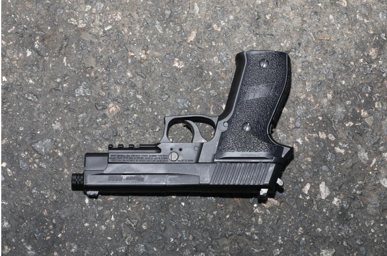
Figure 1: Replica handgun recovered at scene