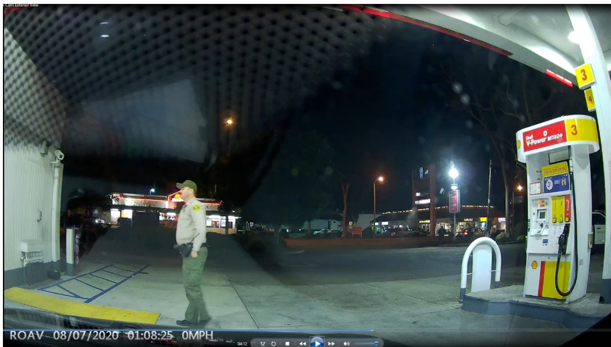
Still photo from Ochoa’s external video camera showing Deputy Nelson approaching the south window of the Shell station.

From the external camera, Deputy Nelson approached the south windows of the Shell station, looked inside, and immediately backed away and took cover. Moments later, deputies yelled, “Drop the gun!” several times. Ochoa replied, “I’ll drop you right now fucker!” The butt of Ochoa’s gun can be seen raised on the far left of the video.