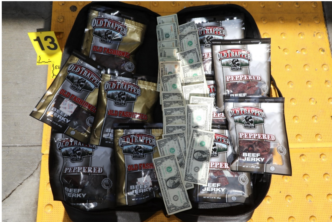
Photograph of the contents of the black tactical bag found outside of the Shell gas station. The bag contained $128.

LASD Deputies Pombal and Nelson canvassed the area for Ochoa and observed a vehicle matching the description of a dark Honda at a Shell gas station at the intersection of Hacienda Boulevard and Gale Avenue. Once in the parking lot, Nelson and Pombal observed Ochoa exit the store with a large black rifle in hand. Nelson and Pombal ordered Ochoa to drop the rifle. Ochoa refused and pointed it at the deputies. Deputy Pombal fired several rounds at Ochoa, but Ochoa was able to get into his Honda and drive away. Ochoa fled southbound on Hacienda Boulevard and then entered the westbound 60 freeway.