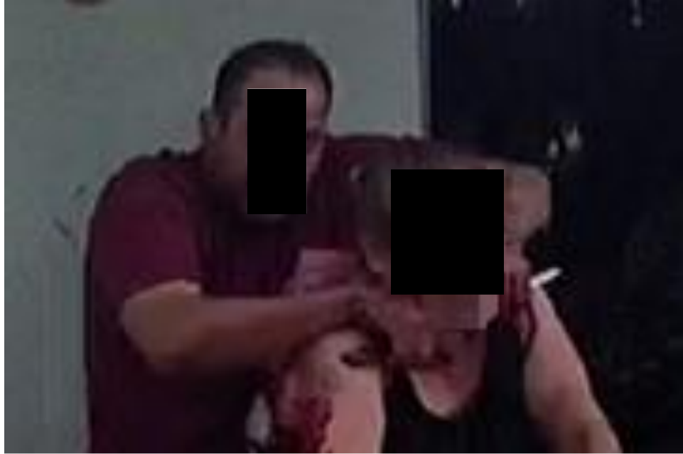
Screenshot from Trock's BWV depicting Perez holding a knife to Tollison's throat.