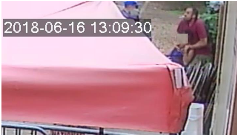
Screenshot from Hope of the Valley's surveillance video depicting Perez's assault on [REDACTED].