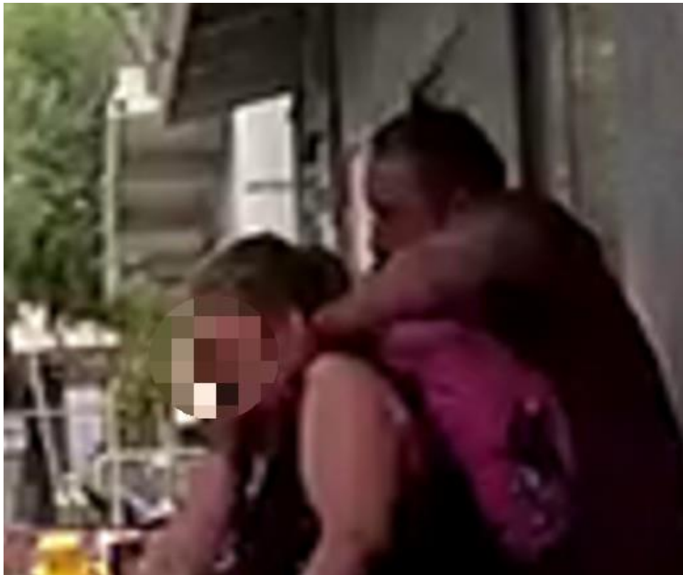
Screenshot from Bonilla's BWV depicting Perez holding a knife to Tollison's throat.