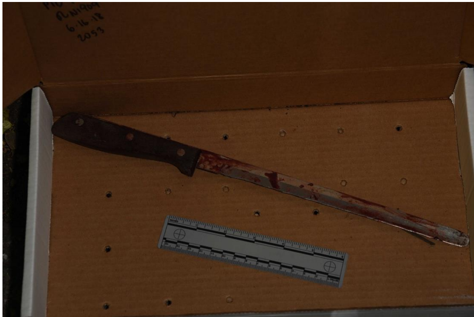
Photograph of Perez's knife.