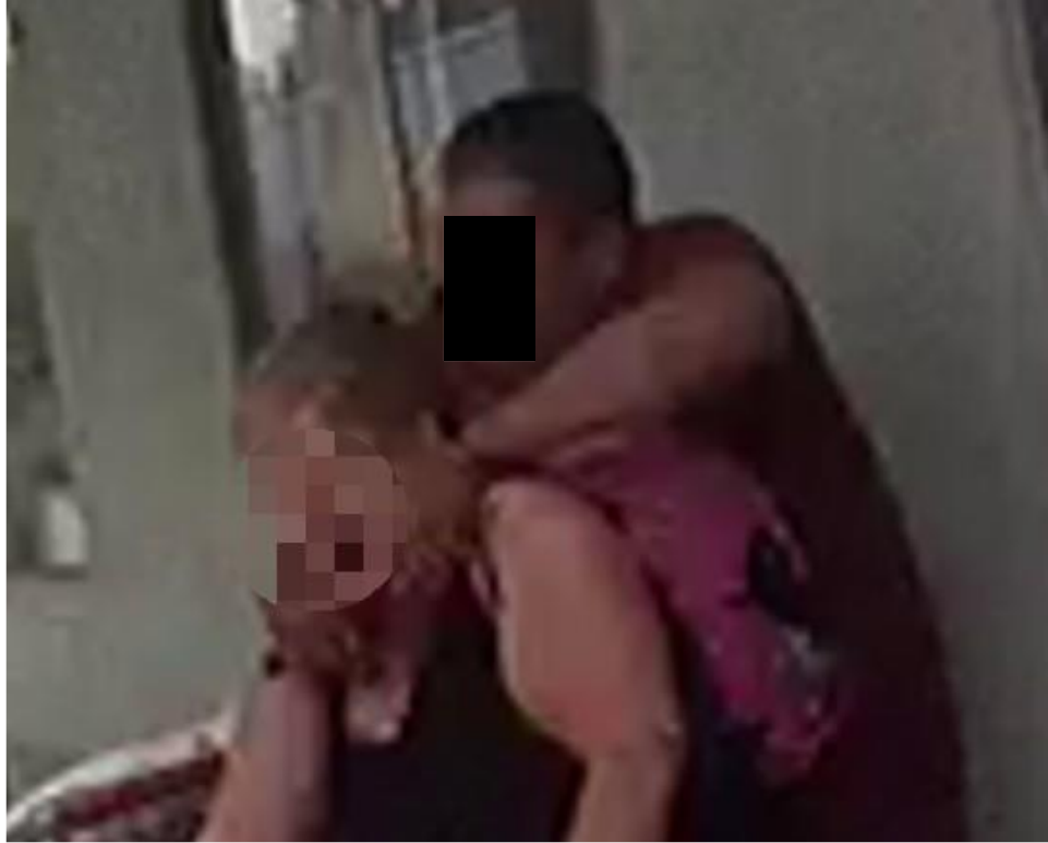
Screenshot from Damiano's BWV depicting Perez holding a knife to Tollison's throat.