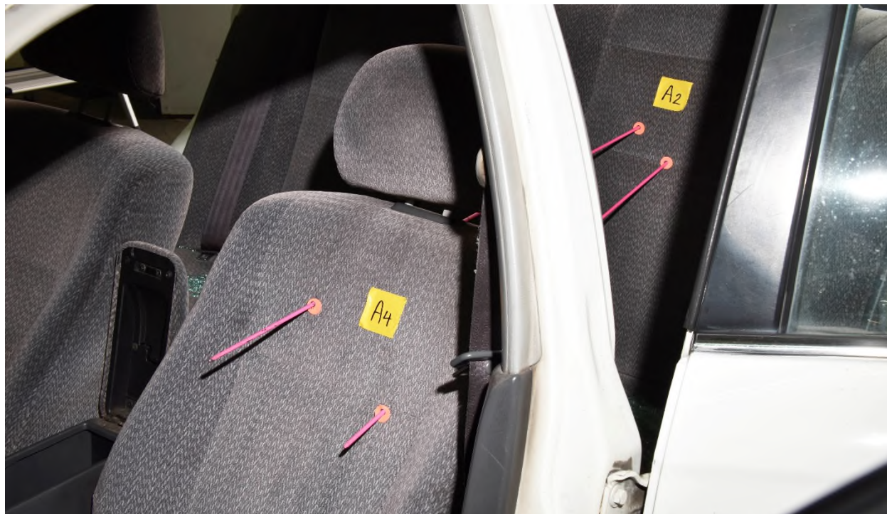
Trajectory of two shotgun pellets through the driver's seat of the Honda.

Criminalists were unable to identify any shotgun impacts to the police vehicle. Criminalists inspected the Honda and identified the trajectory of two shotgun pellets that entered through the trunk and continued through the driver's seat.