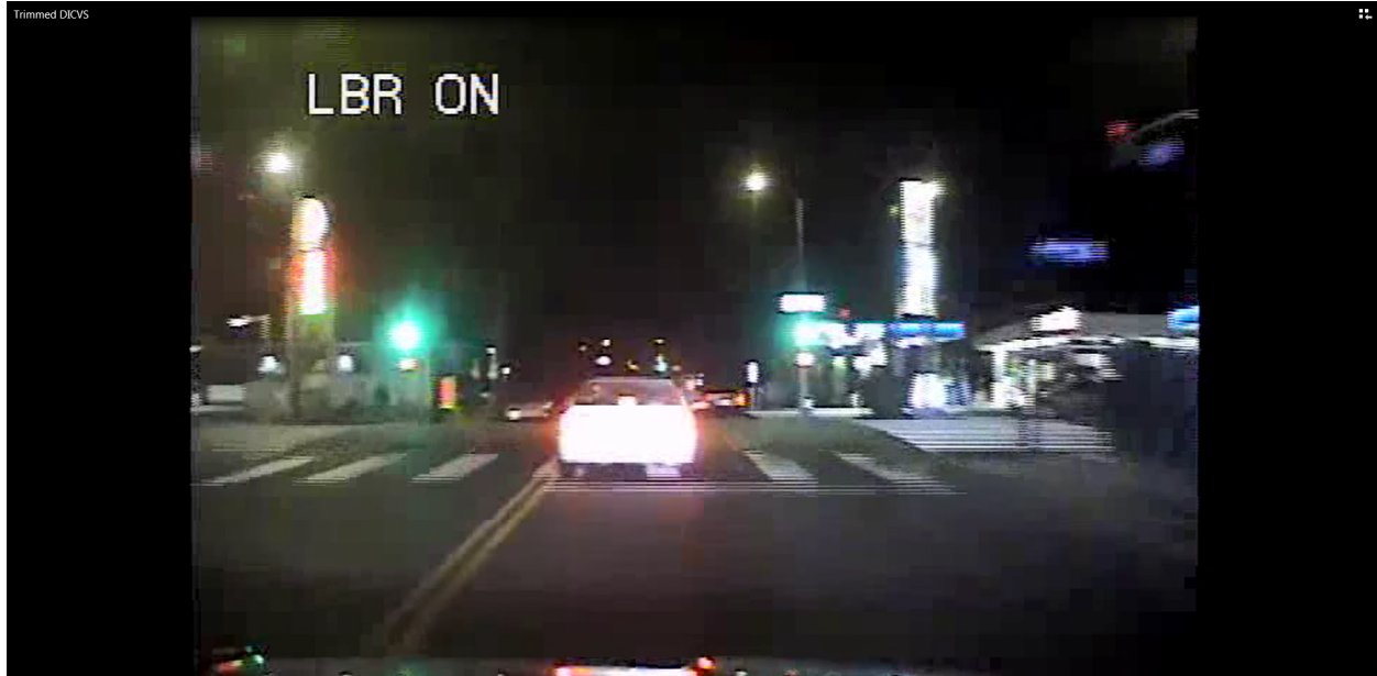
DICVS showing Guerrero leaning out of the Honda holding a shotgun crossing Figueroa Street.

shines a spotlight into the Honda. The Honda accelerates and fails to stop at two more stop signs. The Honda turns left onto North Avenue 52, failing to stop at another stop sign. The officers follow and begin to close the distance with the Honda. 14 As the Honda crosses Figueroa Street, Guerrero leans his entire upper torso out of the passenger window, turns his body back towards the SUV, and points a shotgun directly at the officers. 15