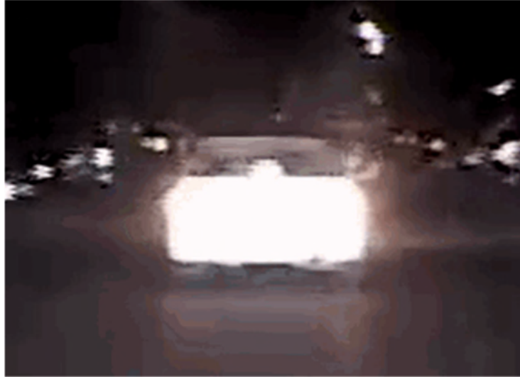
Guerrero firing at officers from the Honda along North Avenue 52.

Potts returns fire. Guerrero leans his torso out of the Honda several times and shoots back at the officers. A muzzle flash can be seen at least once as Guerrero fires. The Honda fails to stop at the stop sign at Granada Street and drives on the wrong side of the street. Potts asks Oka for the shotgun. Oka broadcasts, "I think he has a shotgun, the passenger on the right... We're turning left on Aldama." The Honda turns left, failing to stop at another stop sign at Aldama Street. Potts fires two shotgun rounds from the passenger side window. Oka broadcasts there are two male passengers in the front. As the Honda turns left onto North Avenue 50 without stopping at the stop sign, the passenger door swings open. Potts fires an additional round. Oka attempts a left turn onto Avenue 50 but crashes against the west sidewalk.