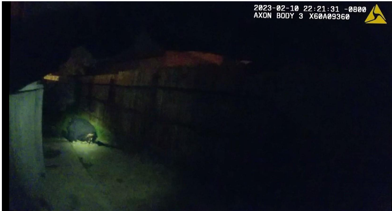
Figure 9 Still photo from Cervantes's BWV showing Byram falling to the ground after being shot and rolling onto his sword.