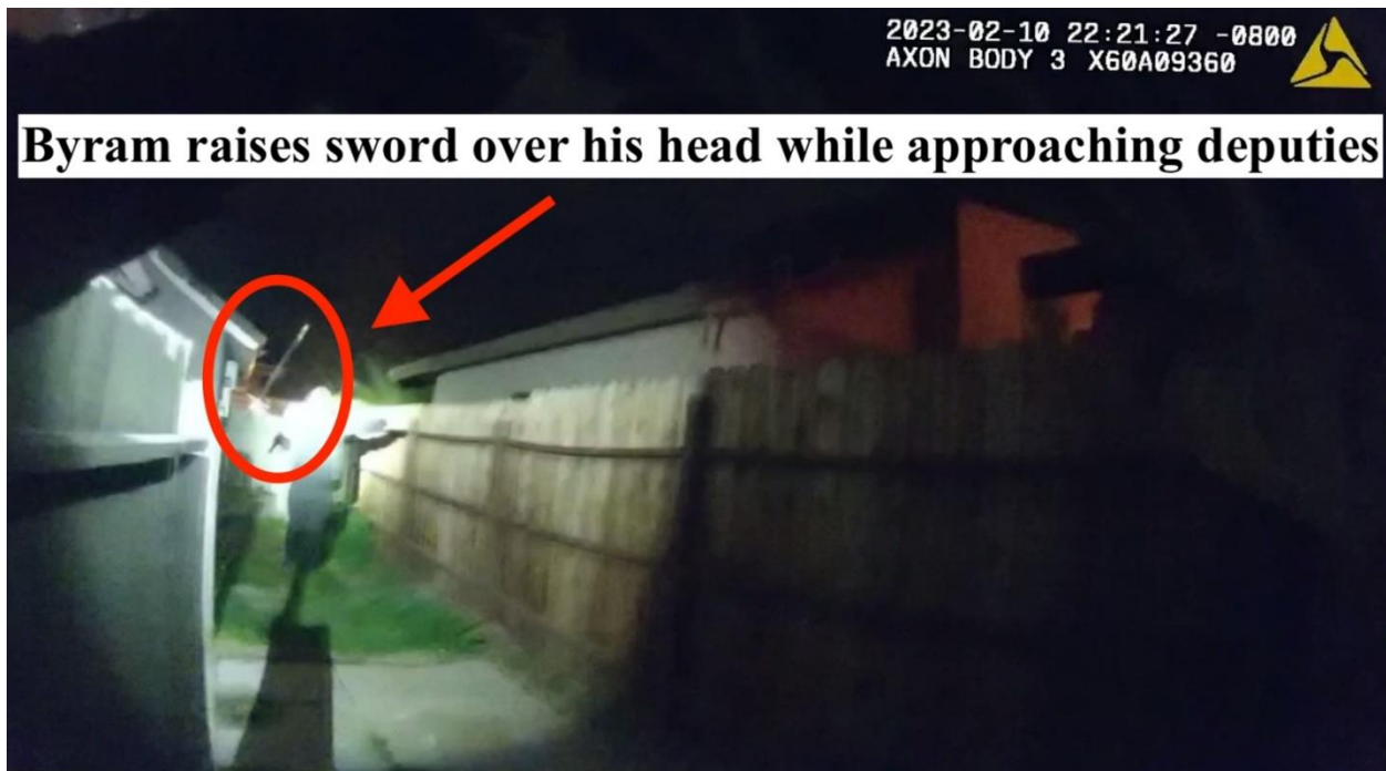
Figure 3 Still photo from Cervantes's BWV showing Byram emerging with his sword in the air and approaching deputies.