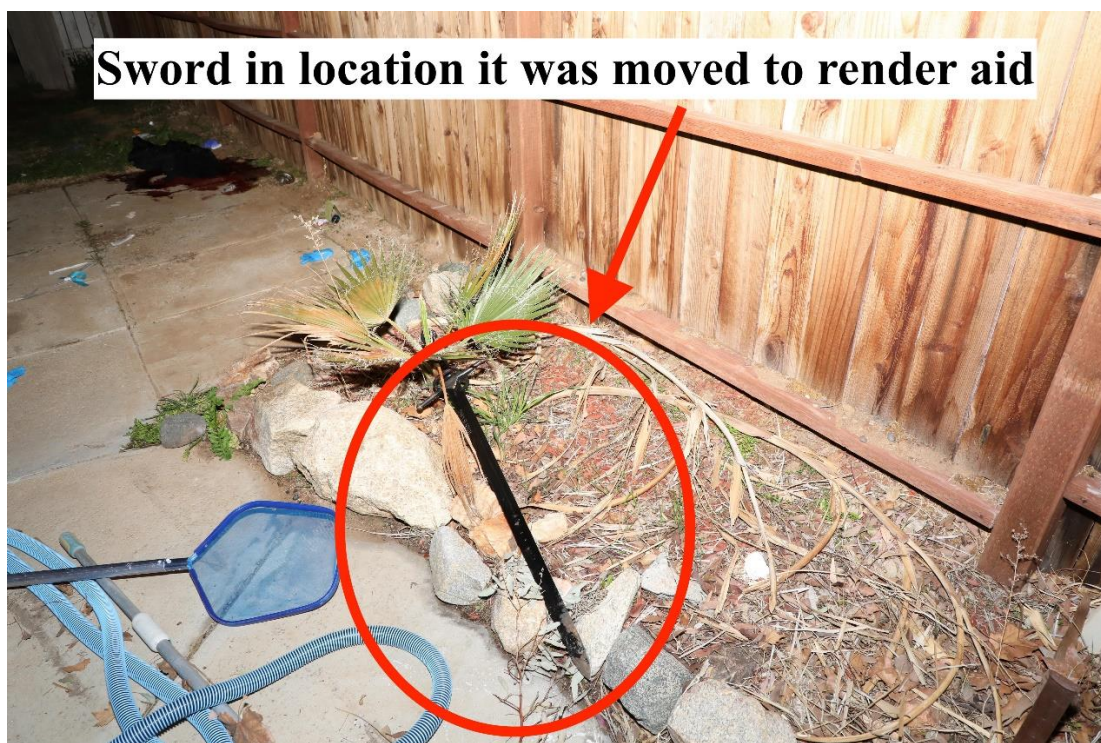
Figure 12 Crime scene photograph showing the sword laying after it was moved while the deputies rendered aid to Byram.