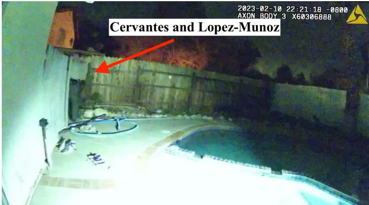
Figure 2 Still photo from James's BWV showing Cervantes and Lopez-Munoz standing at the fence at the moment Byram emerges with his sword and deputies yell, "Hands!"