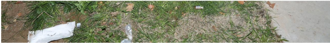
Figure 10 Crime scene photograph looking from where Byram began approaching the deputies towards where the deputies were standing at the time of the shooting. The area behind where the deputies stood had debris strewn around it, as well as a swimming pool almost directly behind them.

Approximate location of deputies at time of shooting