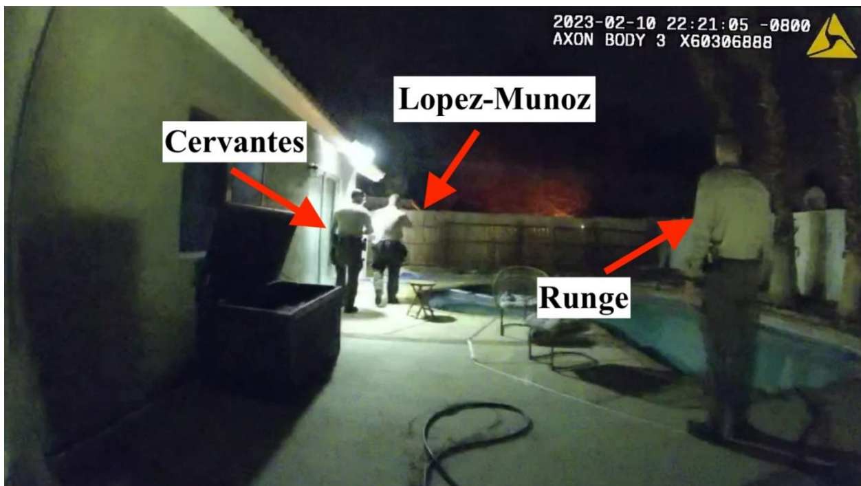
Figure 1 Still photo from James’s BWV showing Cervantes and Lopez-Munoz approaching the location where they first observe Byram while Runge trails behind them.

The BWV shows both the residence and backyard were dark and quiet while the search was taking place, except for one of the babies who was standing and crying in the crib. Eventually, the search continues outdoors into the backyard. Cervantes and Lopez-Munoz approach the side of the house while James and Runge trail behind them.