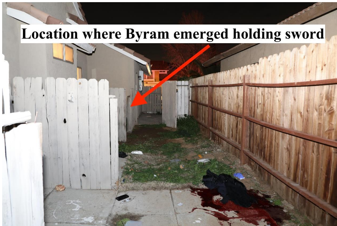
Figure 11 Crime scene photograph showing the location that Byram emerged from with the sword and taken from the approximate location of Cervantes and Lopez-Munoz when they first observed Byram.