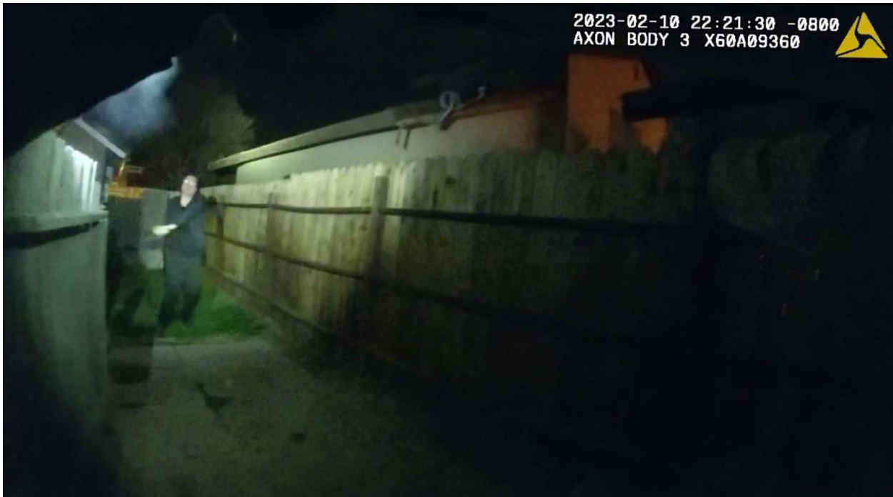
Figure 7 Still photo from Cervantes's BWV showing the moment Cervantes fires 40mm round at Byram.