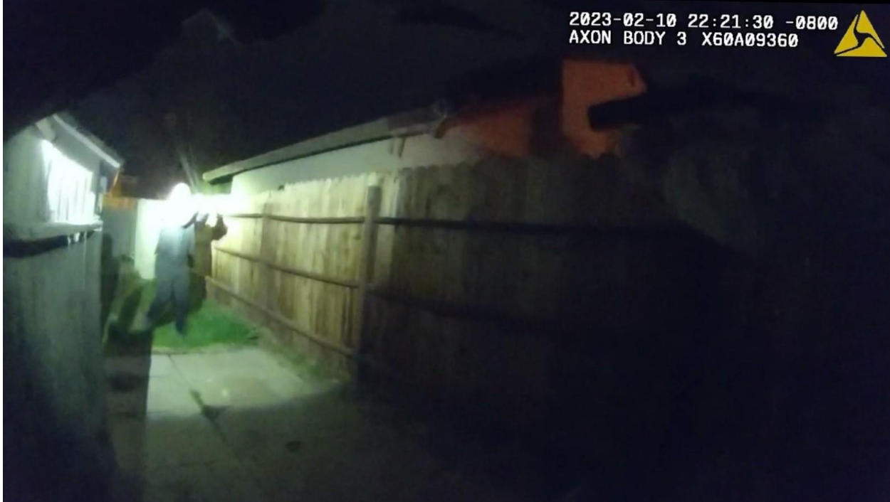
Figure 6 Still photo from Cervantes's BWV showing Byram continuing to approach deputies while swinging sword at the moment a deputy yells, "40!"