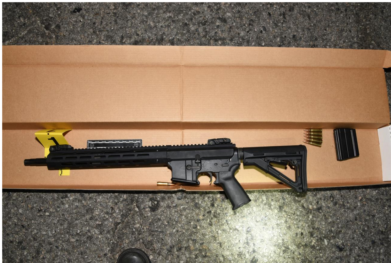
Rifle held by Hurlburt at the time he was shot

Three additional live rounds consistent with Hurlburt's rifle were found inside the residence in the dining room where Hurlburt had been seated. The rifle itself was examined and determined to be an unknown make and model with no serial number.