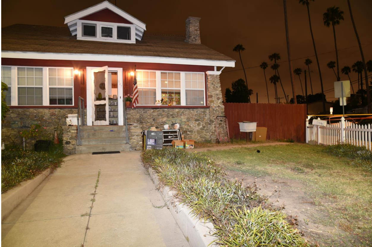
■ Venice Boulevard