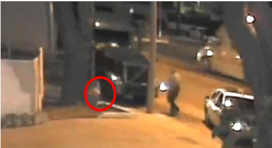
Bowers falling to the ground.