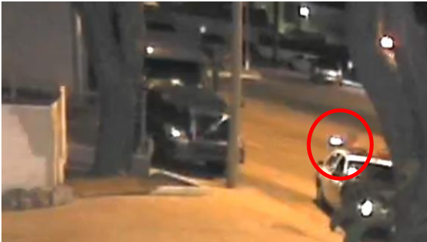
Brito at the rear of the patrol car while Bowers is still behind the tree.