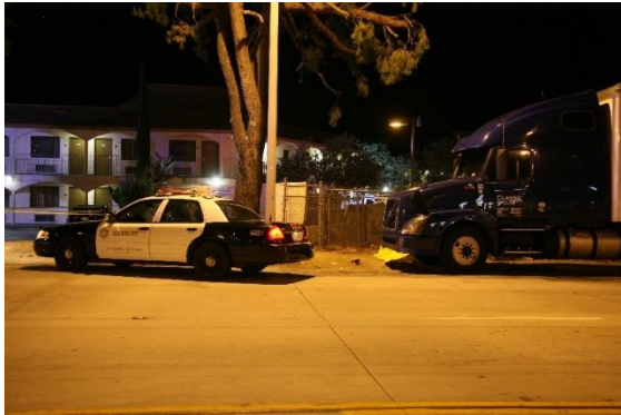
Scene of the OIS