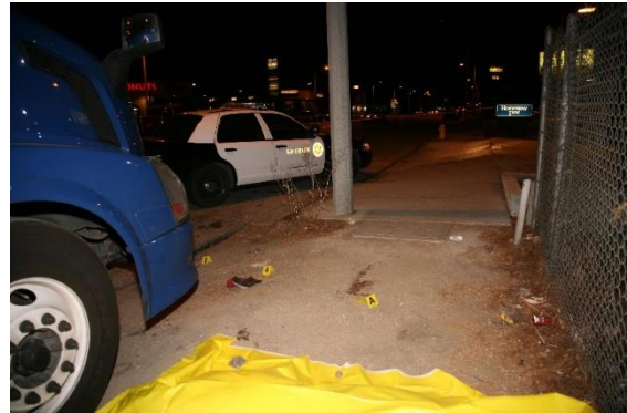
Scene of the OIS

Los Angeles County Fire Department Paramedics rendered medical treatment and pronounced Bowers dead at 9:19 p.m.