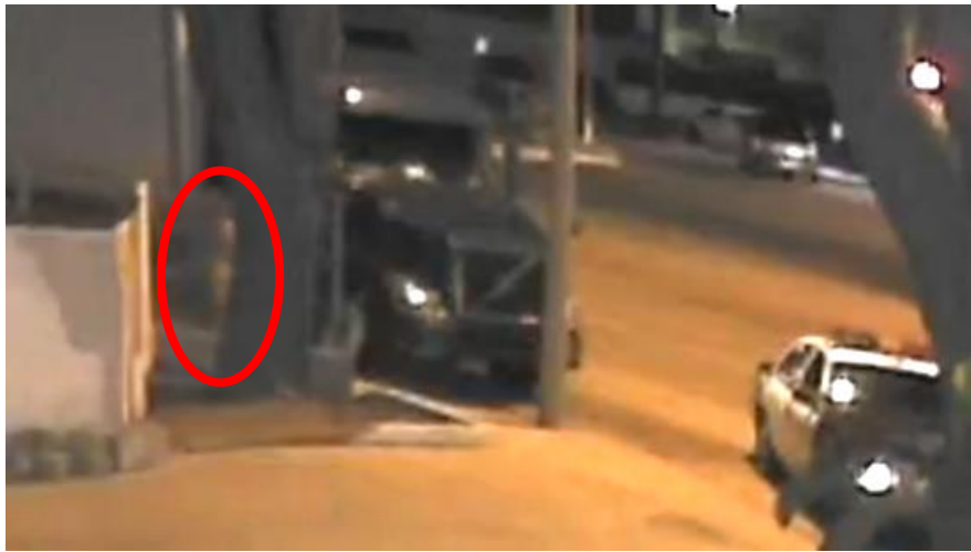
Bowers immediately prior to walking between the box truck and the tree.