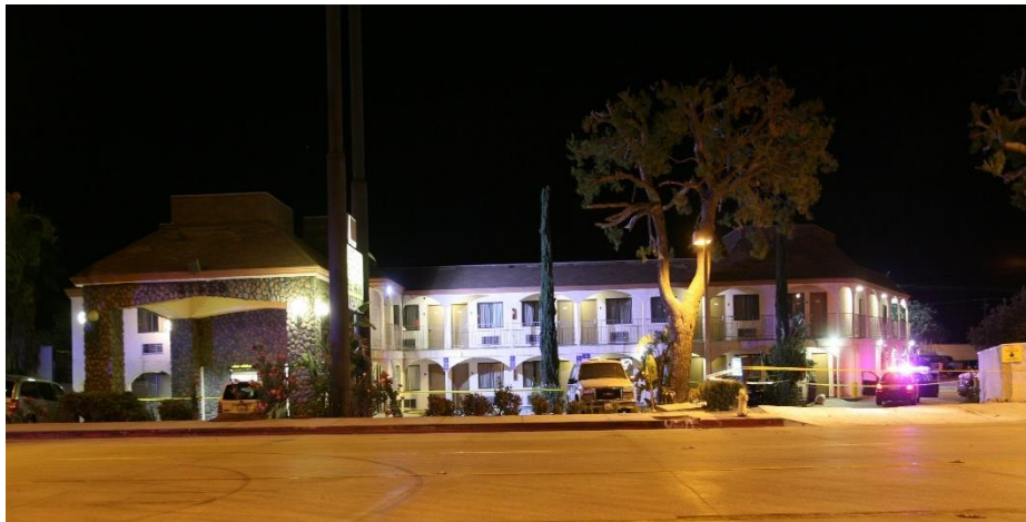
Rodeway Inn, 31558 Castaic Road

of the Inn, away from the deputies. Brito yelled to Bowers, asking him if he would stop and speak with the deputies. Bowers continued pedaling away from the deputies and ignored them.