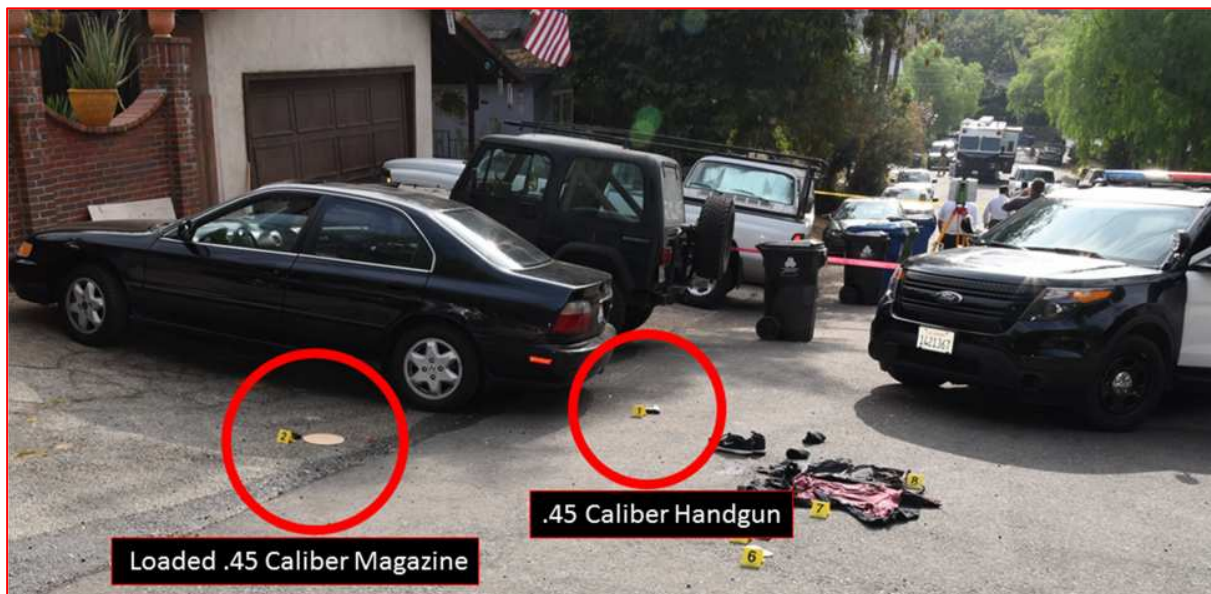
Figure 1- Photograph of the shooting scene with Hatami's gun and magazine circled in red. His black Honda and the officers' patrol vehicle are shown in their respective positions at the time of the shooting.

A photograph of the scene is shown below: