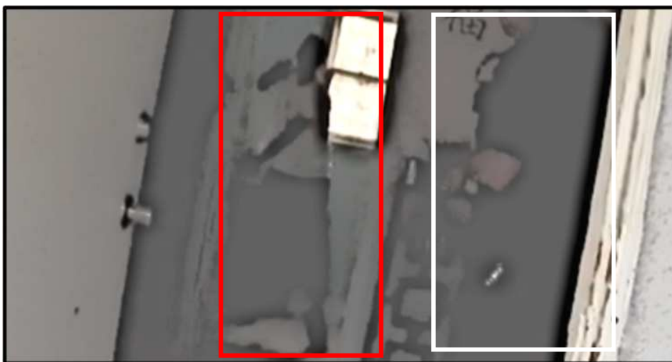
Figure 3C: Still frame image from Valencia's BWV shows Cardoza pointing an apparent firearm towards officers. Cardoza is bounded by red rectangle. Dubois is bounded by white rectangle.