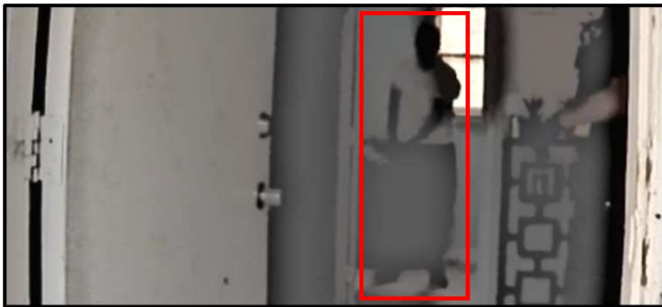
Figure 3B: Still frame image from Valencia's BWV shows Cardoza racking the slide on an apparent firearm.