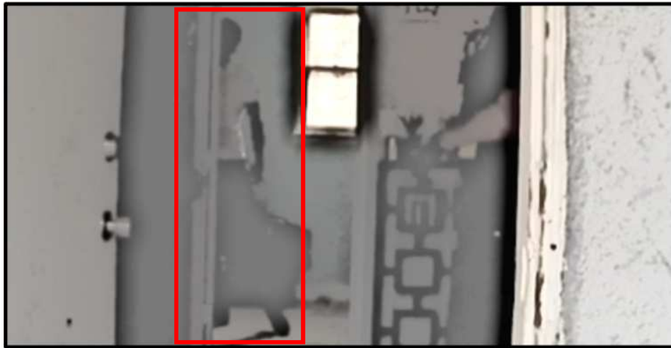
Figure 3A: Still frame image from Valencia's BWV shows the view through the front door of C residence. Cardoza (bounded by the red rectangle) can be seen just left of the window reaching up behind the bathroom door.