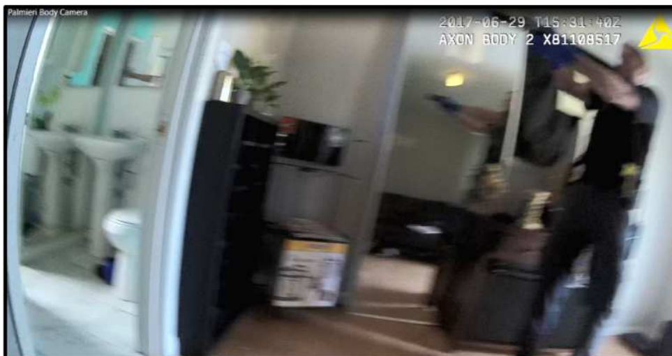
Figure 4B: Dubois aimed his weapon toward bathroom door just before firing commenced.