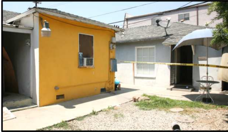
Figure 1A: The open door to C [REDACTED]' residence can be seen on the right near the table and parasol.

back house located on the east side of the lot. See Figure 1A below. C [REDACTED]' residence is located in the back house consisting of a living area adjacent to a kitchen, and a bathroom behind a wall opposite to the front door. See Figure 1B below.