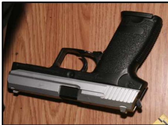
Figure 6: Replica handgun used by Cardoza.

Investigators located Cardoza's replica handgun in the living room. See Figure 6 below showing the replica.