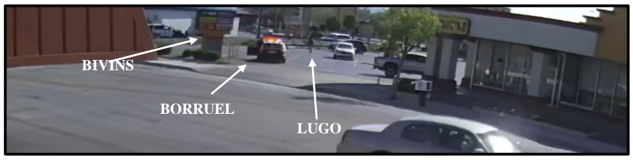
Figure 4: Borruel and Bivins repositioned near Lugo with the black SUV in the background to Lugo's right.

Lugo moved further into the parking lot of 1101 West Avenue I in front of the Donut House. The detectives drove their patrol cars across the street. Borruel had his service weapon drawn and aimed at Lugo. A woman in a black SUV stopped her vehicle in a position that obstructed Borruel's line of fire. Borruel yelled at her to move.