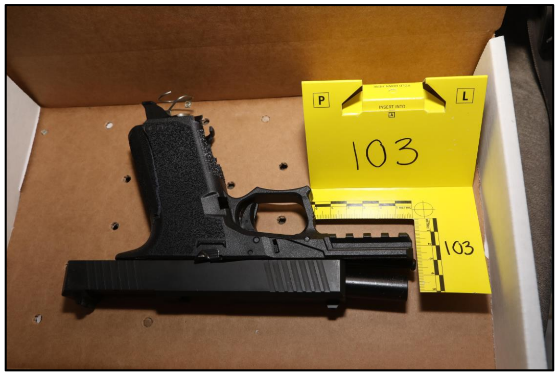
Figure 3: The pistol found inside the van, with damaged grip.