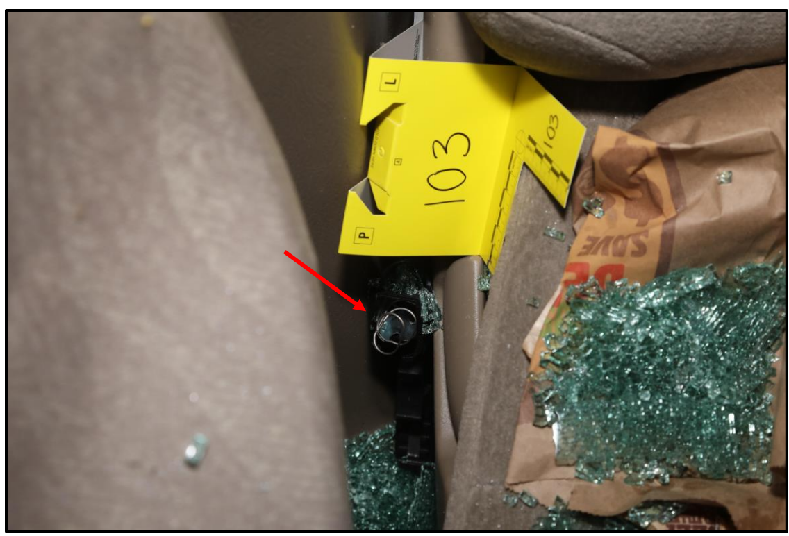
Figure 2: Item 103, the pistol wedged between the van's front passenger seat and door, with the grip facing up and the spring from the magazine visible after being struck by gunfire.