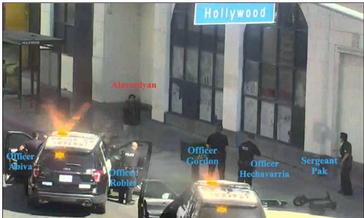
Figure 3: Surveillance video depicting officers' positions just prior to the officer-involved shooting.