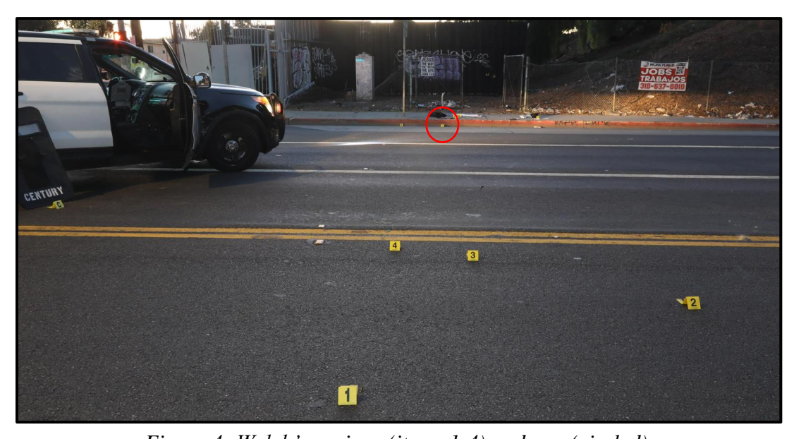
Figure 4: Welch's casings (items 1-4) and gun (circled).

Welch was armed with a department issued 9 mm pistol. Based on the casings recovered and a post incident examination of his weapon, he fired four rounds during the incident.