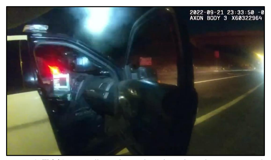
Figure 1: Welch's BWV still; Wright out of view beyond patrol car at moment of Welch's gunshots.