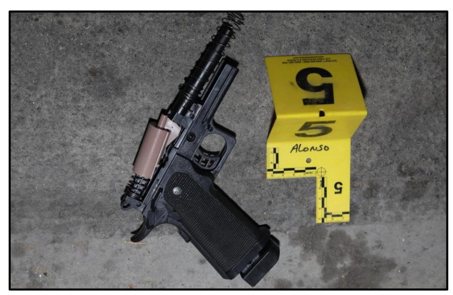
Figure 5: Wright's BB gun.