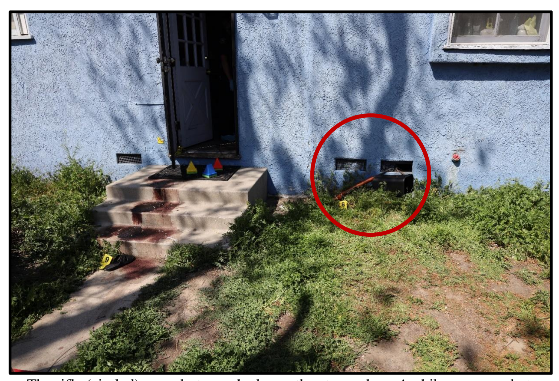
The rifle (circled) was photographed near the steps where Archibeque was shot.