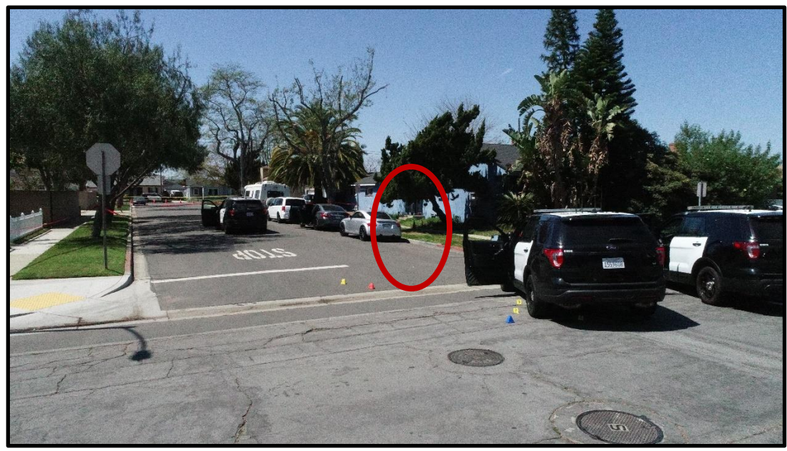
Several officers, including the shooting officers, took cover behind the police cars parked in the intersection with a direct view of the steps (circled) where Archibeque was shot.