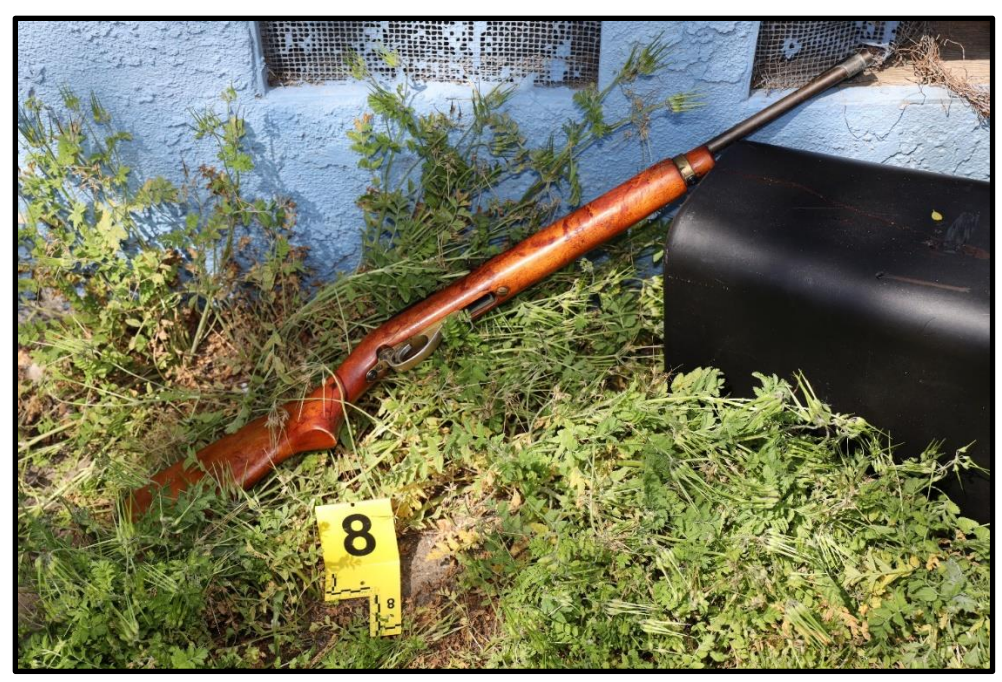
Archibeque's rifle was photographed at the scene.