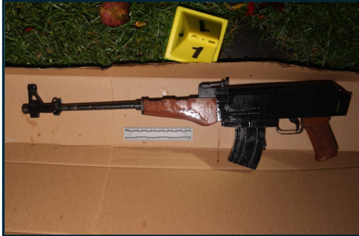
Doby's Rifle as Photographed at the Scene.