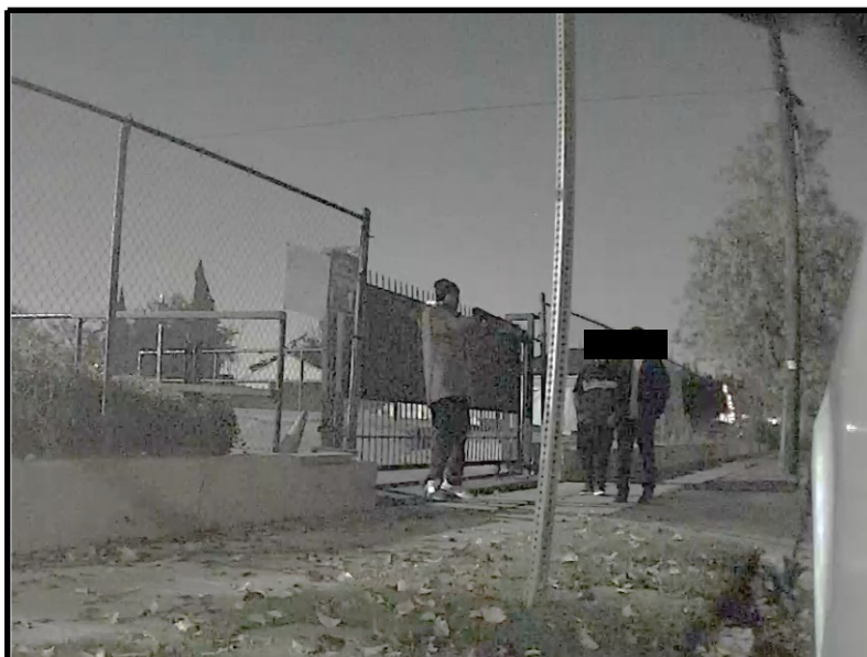
Still from the Tesla Surveillance Video Depicting Doby (Left) Pointing the Rifle at ██████████ (Middle) and ██████████ (Right).

The Tesla cameras captured video of the initial encounter between the suspect and the victims as well as portions of the subsequent struggle. Doby can be seen approaching the victims on foot along the sidewalk. Doby holds the rifle beneath a jacket before removing it and pointing it toward the victims. Doby forcefully grabs a gold chain from around ██████████'s neck. Immediately afterward, ██████████ tackles Doby to the ground and the two begin struggling for control of the rifle. ██████████ attempts to restrain Doby while ██████████ continues attempting to gain control of the firearm. Doby's knife is visible in his hand as the victims attempt to restrain him. The victims continue struggling with Doby on the sidewalk as the officers approach. Moments later Diaz appears to fire one shot and the parties separate.