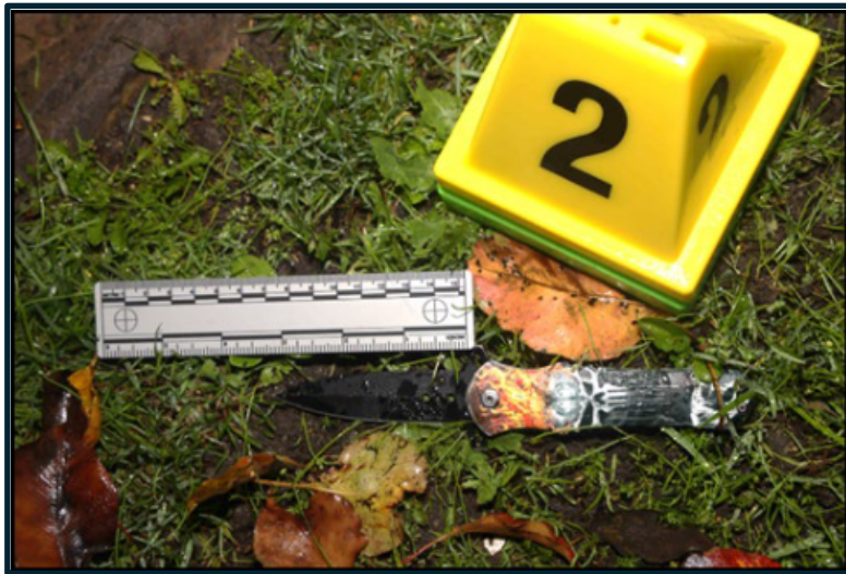
Doby's Knife as Photographed at the Scene.