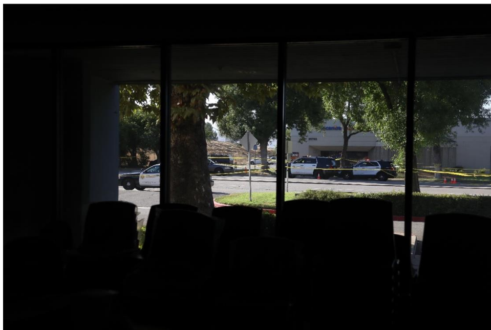
Photograph of the view of the scene of the shooting from ██████████'s workplace lunch room.