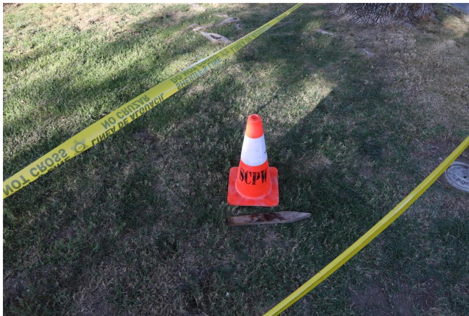
Photograph of the wooden stake.