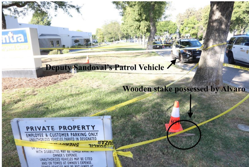
Photograph of the Concentra sign and Alvaro's wooden stake with Sandoval's car in the background.