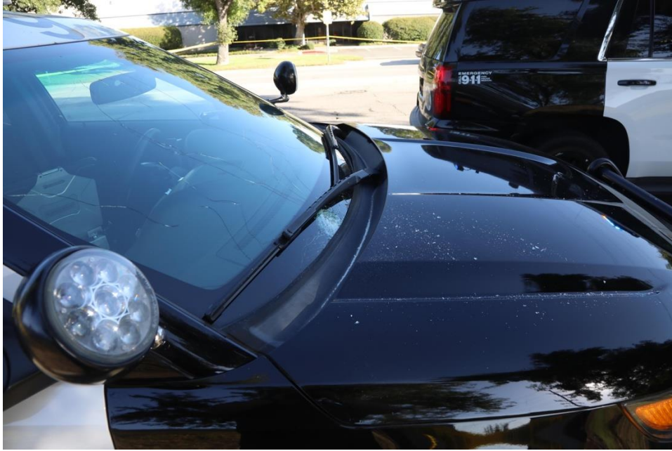
Photograph of Sandoval's patrol vehicle with a broken windshield.