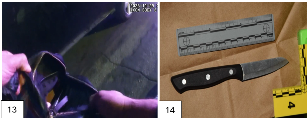
Figures 13 and 14: Screen Capture of BWV Showing the Knife Inside Briones' Purse and a Photograph of the Knife After Being Removed, Respectively.