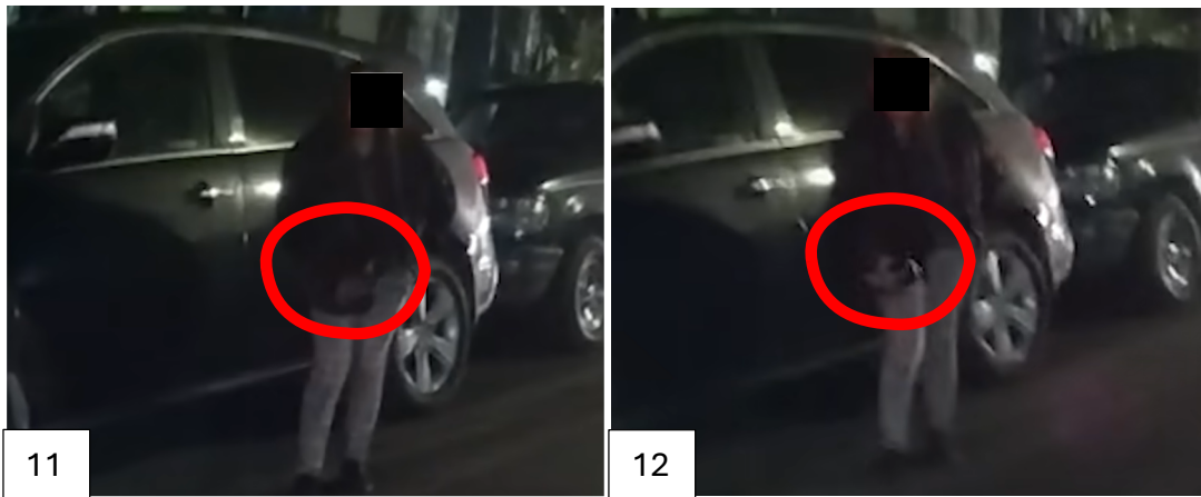
Figures 11 and 12: Screen Captures of BWV Seconds After the Shooting Depicting the Outline of Briones' Right Hand Inside Her Purse and Being Quickly Withdrawn.