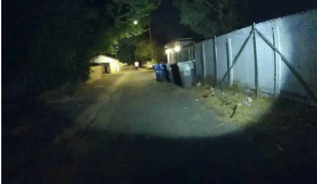
Fig. 2 — Still image from Pena’s BWV capturing Covey in the alleyway during the foot pursuit.

Covey began to run westbound on Market Street from the alleyway. Wyatt and Pena gave chase but lost sight of Covey when they arrived at the intersection of the alley and Market Street. Wyatt broadcast the suspect was running down Market Street. The deputies continued west on Market Street toward Arch Street, where Wyatt and Pena saw Covey running south on the west sidewalk of Arch Street. Wyatt saw [REDACTED] appear on the west side of Arch Street before moving toward the east side of the street.