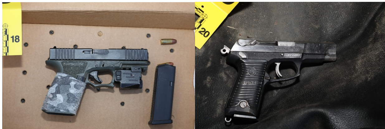
Figs. 3 (left) and 4 (right) — Polymer80 (left) and Ruger P89 (right) pistols recovered from Covey.

Wyatt rendered aid to Covey with assistance from Noll. Covey was searched and found to be in possession of two loaded pistols: a Polymer80 “ghost gun” 5 with a black slide, green grip, and affixed laser, and a Ruger P89 black-framed pistol with a silver slide and a partially obliterated serial number. Investigators recovered two expanded cartridge casings within the vicinity of where Cory fell, as well as a fired bullet jacket. All were determined to have been fired from Covey’s Ruger pistol. Covey’s DNA was found on various portions of both guns.