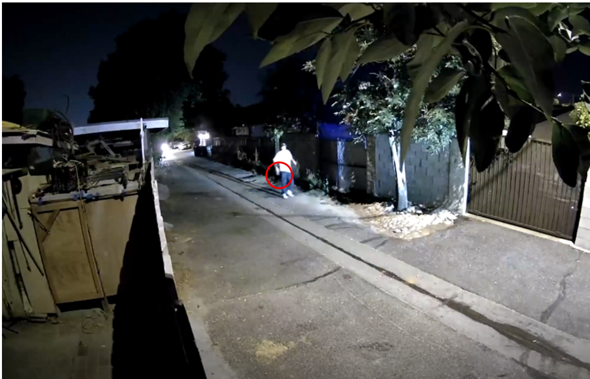
Fig. 5 — Still image from a surveillance video of Covey walking with an object in his right hand.

Surveillance video was obtained from multiple locations. In the videos, Covey can be seen running through the area, followed by deputies. One camera captured Covey in an alleyway walking away from Wyatt and Pena. Covey can be seen holding an object in his right hand, consistent with the deputies' description of him holding a gun with the barrel facing down.